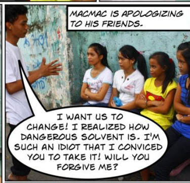
MACMAC IS APOLOGIZING TO HIS FRIENDS.

WHAT DID I DO?! I GOT THEM INTO THIS DRUG. I HAVE TO CHANGE! I WILL HELP THEM TO CHANGE THEIR LIVES, TOO!