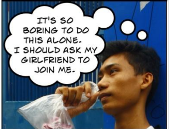
MACMAC HAS BEEN USING SOLVENT FROM A VERY YOUNG AGE.

IT'S SO BORING TO DO THIS ALONE. I SHOULD ASK MY GIRLFRIEND TO JOIN ME.