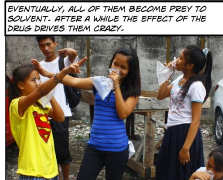
EVENTUALLY, ALL OF THEM BECOME PREY TO SOLVENT. AFTER A WHILE THE EFFECT OF THE DRUG DRIVES THEM CRAZY.