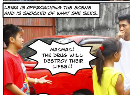
LEIRA IS APPROACHING THE SCENE AND IS SHOCKED OF WHAT SHE SEES.

MACMAC! THE DRUG WILL DESTROY THEIR LIVES!!