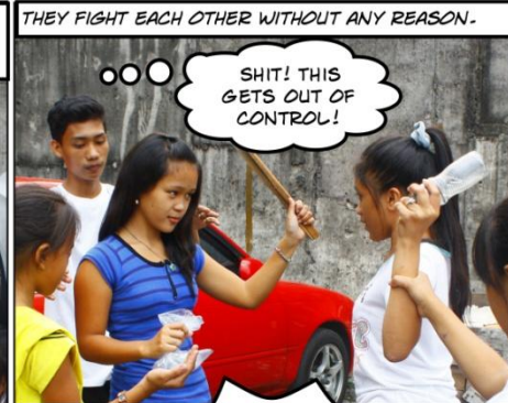
THEY FIGHT EACH OTHER WITHOUT ANY REASON.