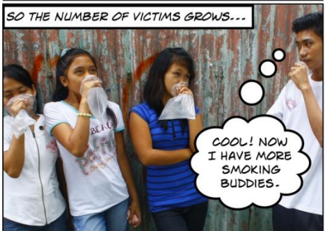
SO THE NUMBER OF VICTIMS GROWS...