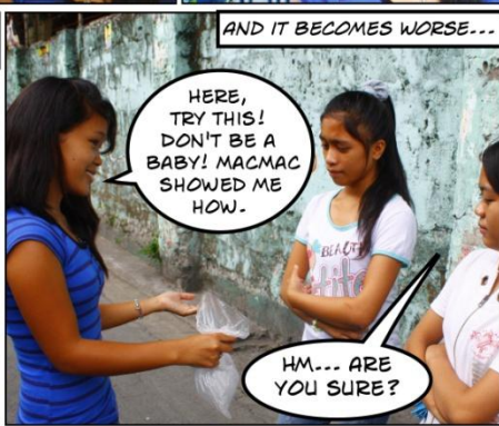
AND IT BECOMES WORSE...

SEE! IT'S SO GOOD. YOU CAN FORGET ABOUT ALL YOUR PROBLEMS!